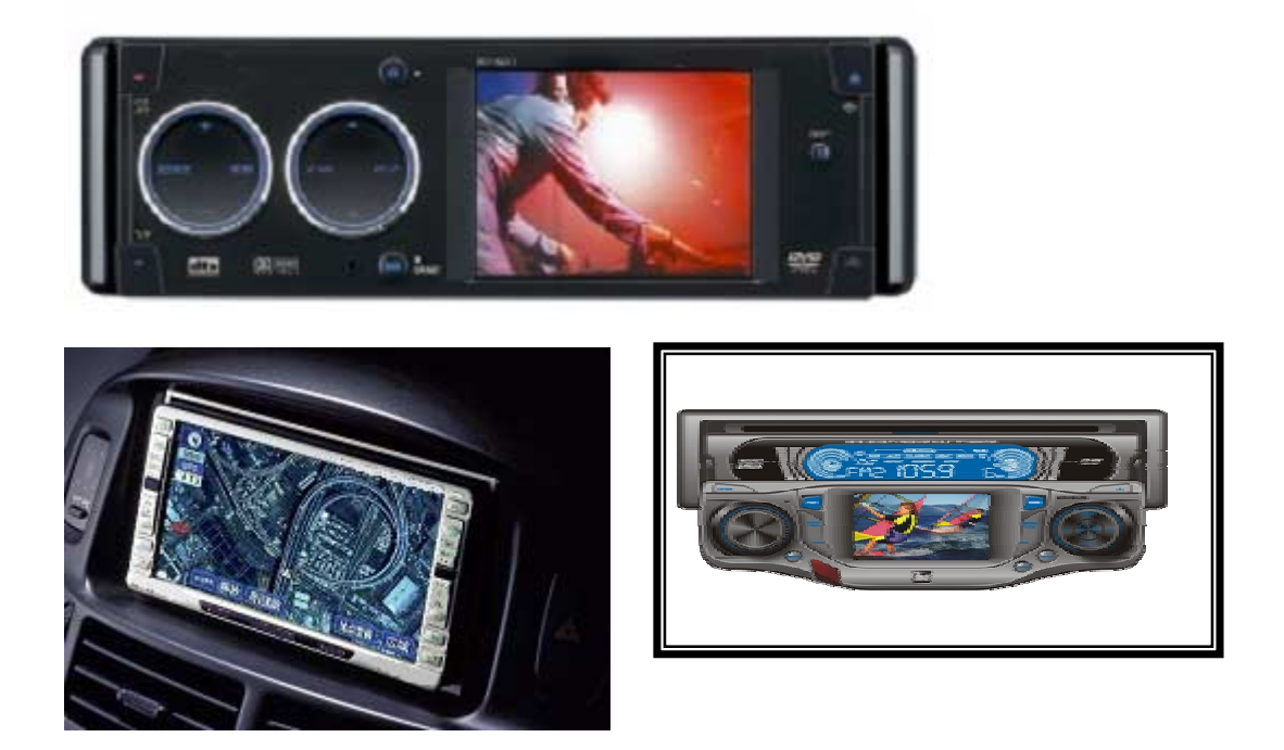
Figure 2 – SSD1921 solution in car A/V application